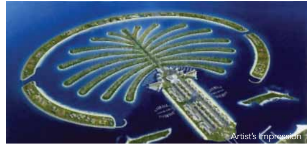
Palm Jumeirah Villas, U.A.E